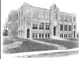
Did you know that in the 1920s and '30s, our school was "U-shaped," and students played handball where St. Mary's Hall is now! Learn more about our school's history at www.stgabeschool.org

Cash & Carry Scrip Available at Market Day Pickup This Wednesday!